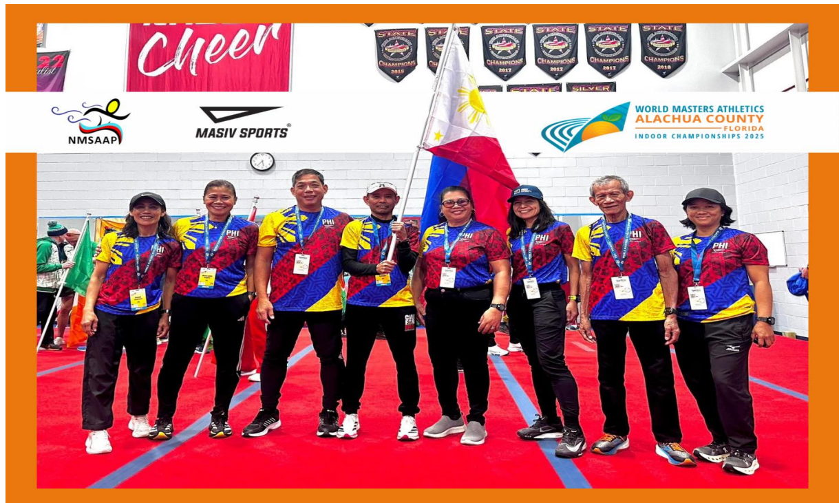
Philippine delegation at the World Masters Athletics Indoor Championships, Alachua County, Florida (2025).